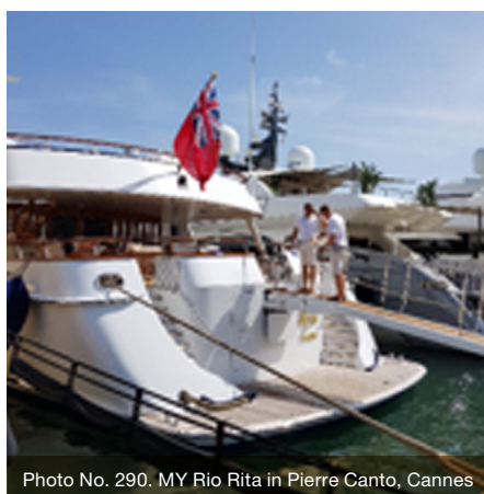
Photo No. 290. MY Rio Rita in Pierre Canto, Cannes