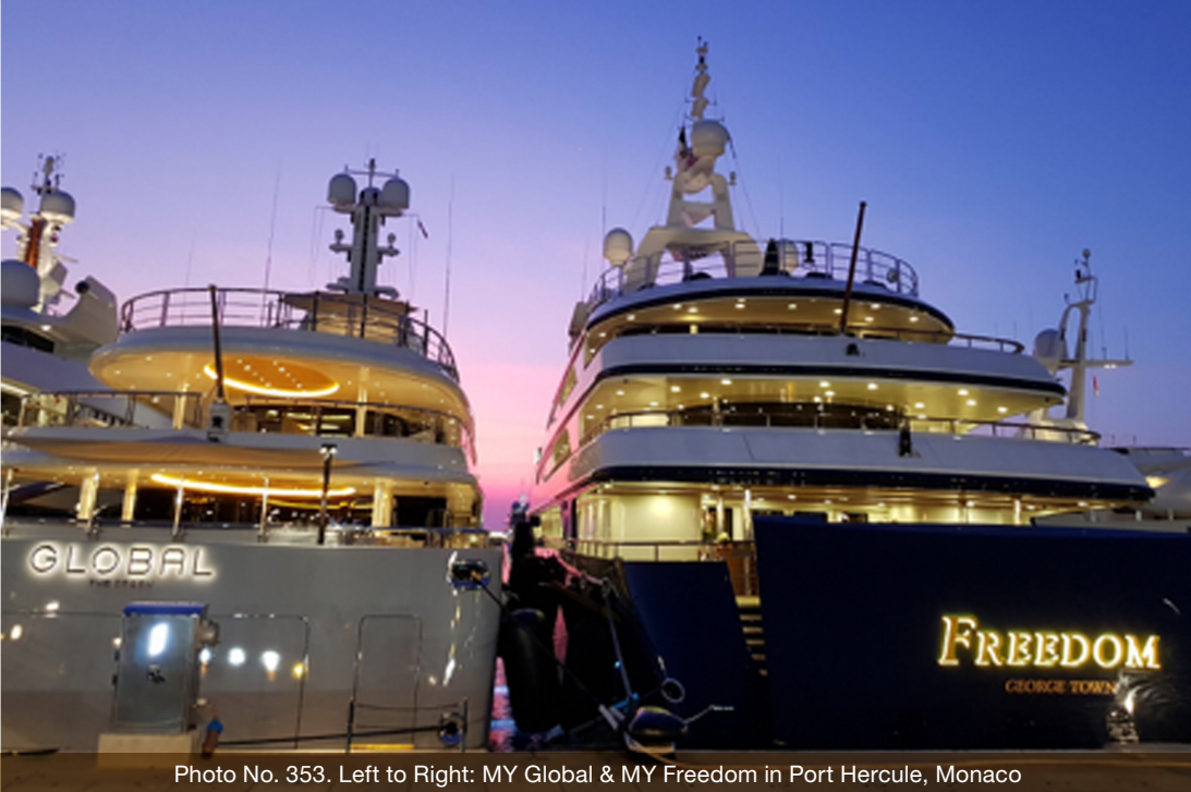
Photo No. 353. Left to Right: MY Global & MY Freedom in Port Hercule, Monaco