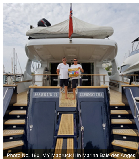
Photo No. 180. MY Mabruk II in Marina Baie des Angles