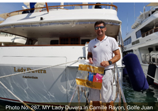
Photo No. 287. MY Lady Duvera in Camille Rayon, Golfe Juan